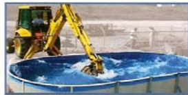
A vigorous backhoe test is performed prior to the launch of each new pool.

The Engineering design of the Channel-Lok II buttress system has been developed to require fewer buttresses without compromising its strength and reliability. Along with Atlantic's unique structural system and fewer buttresses, the Channel-Lok II buttress system will be appreciated for its good looks and ease of installation. This buttress system can be installed on a flat concrete surface. There is no excavation or digging needed on a flat compacted level surface.